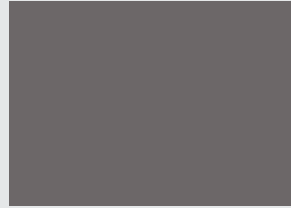
R12/SGR12/PT12 Storm Gray