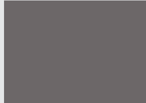
R12/SGR12/PT12 Storm Gray