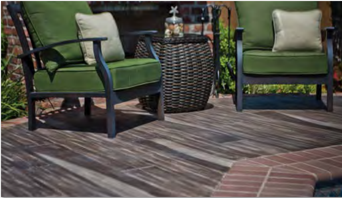
Wood Grain Texture Patios

As a self-bonding, cement based product, SureSpray was formulated to make resurfacing concrete easy. While designed to be sprayed with a hopper gun, it may also be applied with a trowel or squeegee for application flexibility. Additionally, it is available in two formulations to suit your project demands.