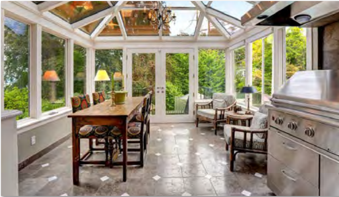
Tile Texture Concrete Floors

Slower cure time for high temperature exterior applications